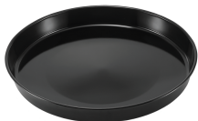
Round Tray (Larger Than Pizza Tray)